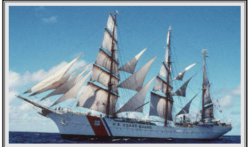
"America's Tall Ship" USCG Barque Eagle